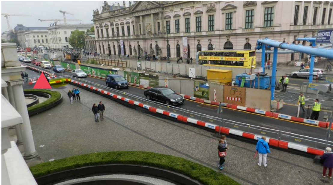
1: View to the west from UdL1