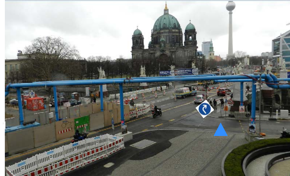
2: View to the east from UdL1